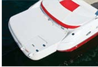
EXTENDED SWIM PLATFORM (H180-H190)