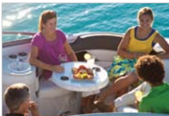
COCKPIT TABLE (FRONT & BACK MOUNTS)