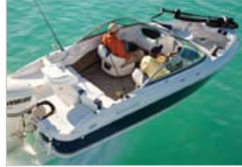
FISH & SKI (180 OB ONLY)