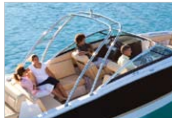
STAINLESS STEEL ARCH (H210 & UP, SL, F SERIES)