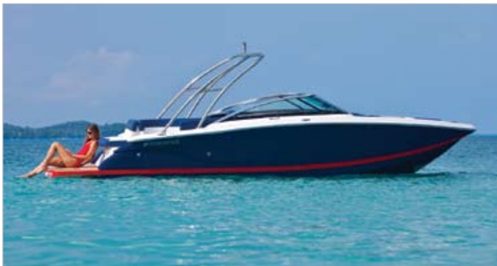
SOLID HULL GEL SCHEME (AVAILABLE ON H200 & UP, SL SERIES)