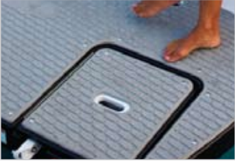
SWIM PLATFORM MAT

NOT ALL OPTIONS AVAILABLE ON ALL MODELS; SEE WEBSITE FOR DETAILS.