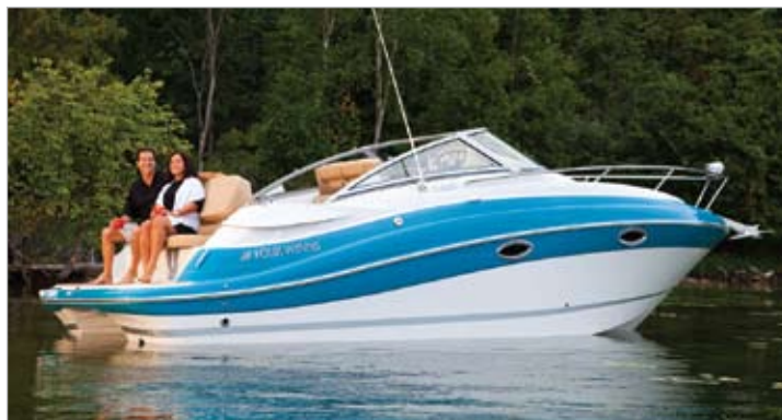
TWO-TONE GEL SCHEME (STANDARD ON F SERIES, V SERIES)