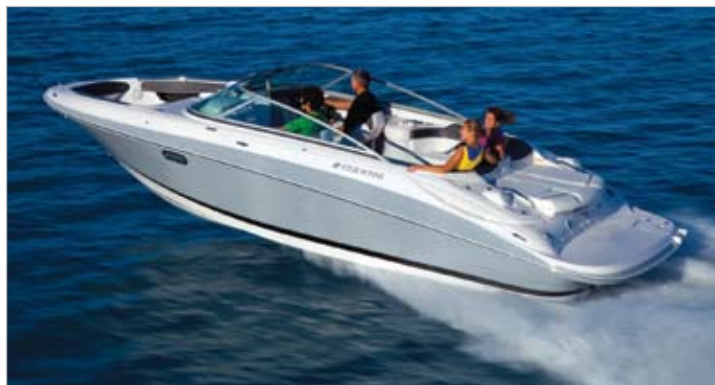
CLASSIC COLOR BAND GEL SCHEME (STANDARD ON H200 & UP, SL SERIES)