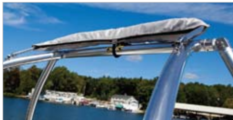
BIMINI TOP STORAGE BOOT