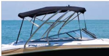
BIMINI TOP FOR STAINLESS STEEL ARCH