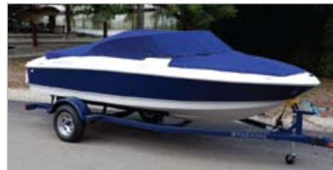
COCKPIT AND FORWARD COVER