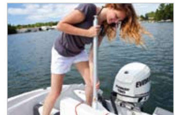
SKI PYLON (OUTBOARDS ONLY)