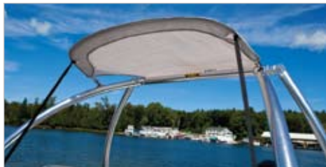
BIMINI TOP FOR WAKEBOARD TOWER