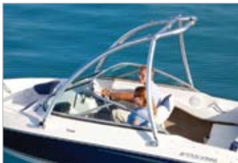
WAKEBOARD TOWER (OB MODELS)