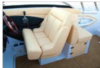
FLORENTINE INTERIOR (H200 & UP, SL SERIES)