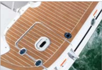
FLEXITEEK SWIM PLATFORM