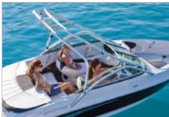
WAKEBOARD TOWER (H180-H200, F SERIES)