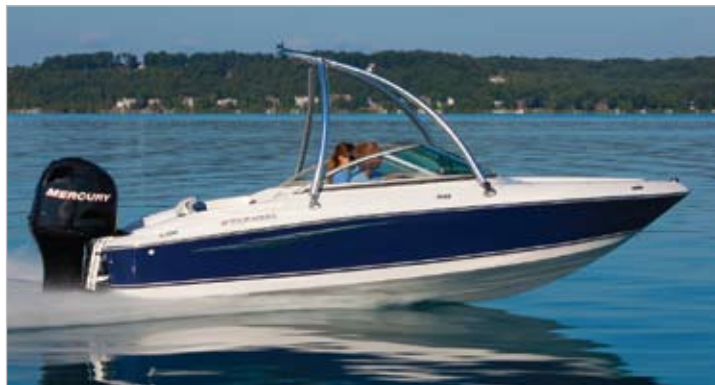
FULL-BAND GEL SCHEME (STANDARD ON H180, H190 & LE SERIES)