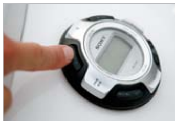
STEREO REMOTE AT SWIM PLATFORM