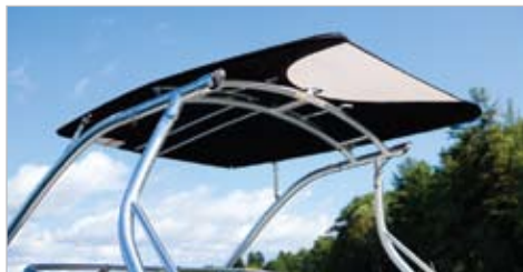
SLEEK AND STYLISH BIMINI TOP FOR WAKEBOARD TOWERS HAS A REMOVABLE CENTER PANEL FOR TOW SPORTS