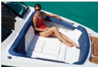
BOW FILL-IN CUSHIONS