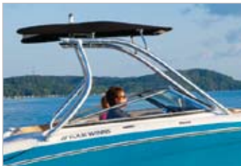
WAKEBOARD TOWER (H210-H260)