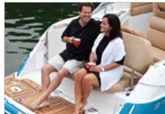
ADJUSTABLE MEDITERRANEAN SEATING (V SERIES / SHOWN IN SEASIDE)