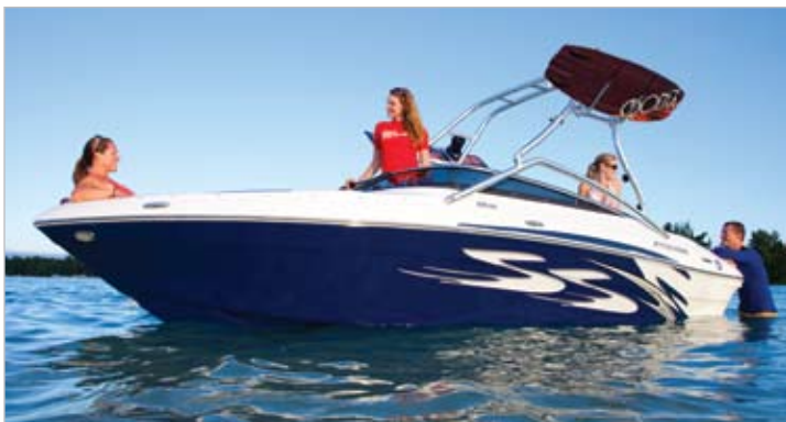
SIGNATURE SERIES (SS) GEL SCHEME (AVAILABLE ON H180 - H220)