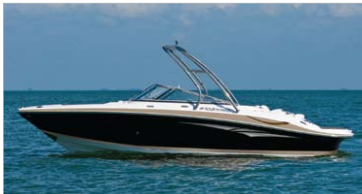
TRI-TONE GEL SCHEME (AVAILABLE ON H200 & UP, V SERIES)