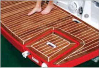
REAL TEAK SWIM PLATFORM