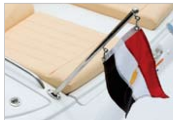
FLAGPOLE & HOLDER (FLAG NOT INCLUDED)