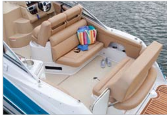
SEASIDE INTERIOR W/SEAGRASS MAT (V SERIES)