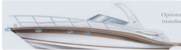
Optional Two Tone (standard on V288)