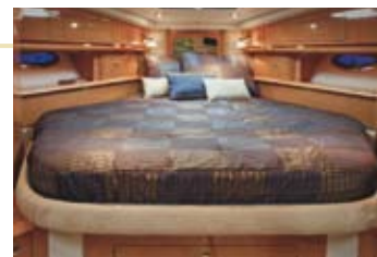
Midnight Blue Interior Décor Package