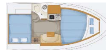
Standard Floor Plan