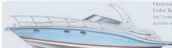
Optional Classic Color Band (w/ contrasting accent stripe)