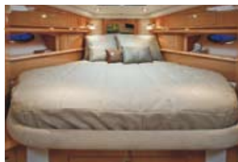
Sea & Sand Interior Décor Package