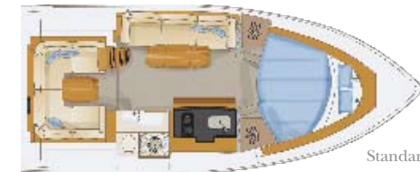
Standard Floor Plan