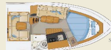
Standard Floor Plan