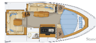
Standard Floor Plan