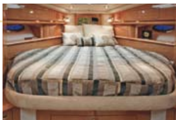
Black & Tan Interior Décor Package