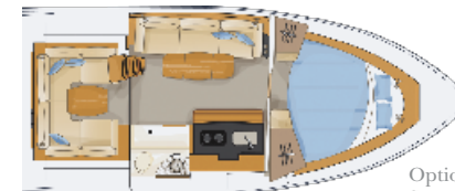
Optional Private Stateroom