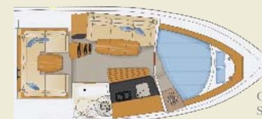
Optional Private Stateroom