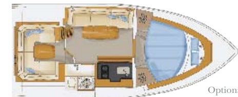
Optional Private Stateroom(s)