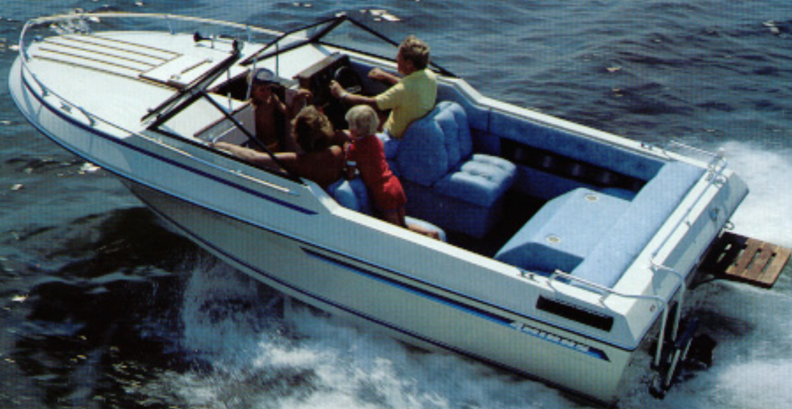
Marquise 180 Cuddy (with optional stern half-platform)