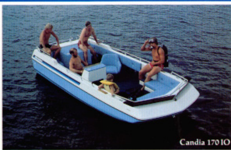
Candia 170 IO