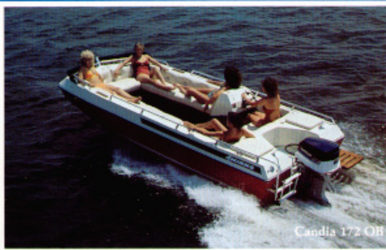
Candia 172 OB