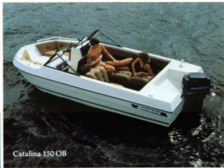
Catalina 150 OB

A speedy "tri-V", it'll take on anything its size on the lake. The 79-in. beam, 37-in. depth give it room and stability. Inside you loaf in cushiony, soft-suede-like vinyl seats. The Brougham option lets you stretch out on a bench or swivel in a salon-like bucket seat. And does it ever move! With up to 100 hp (max.) giving it impetus, it flies. Yet a light, hand laid-up hull keeps it strong for long. It's like a luxury sportster — at less than a luxury price. (3-step boarding ladder is optional at extra cost.)