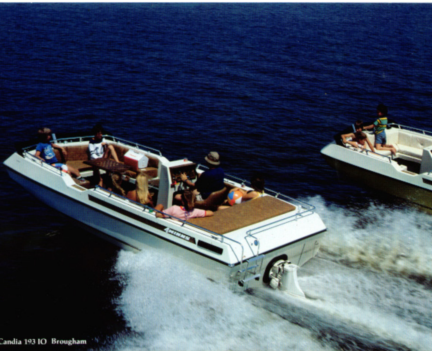
Candia 193 IO Brougham

The Candia 170 is almost as spacious as the 190. With nearly as many seating options. Up to 10 passengers can lounge on soft, suede-like upholstery. The over 7-ft. beam stabilizes the 17-ft. hull at rest or on plane. Yet it's easy to handle . . . even the lady of the family can manage the helm (like John's wife, Mary Jo). IO or OB, the features are similar to its big brother, the 190. There's loads of storage, built-in ice chest, 18-gal. fuel tank, venturi windshield and 3-step boarding ladder (all standard in both Candias).