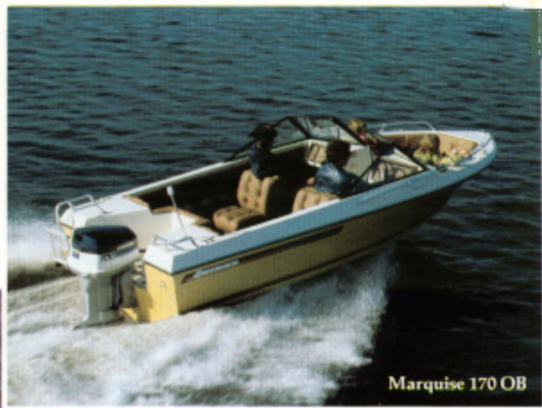
Marquise 170 OB

Its deep "V" hull cuts through chop, its plush interior easily cushions hours on end. Bow rider models sport a 14-inch high cushion in the 26-inch deep forward section. The luxurious Brougham includes a super-soft sun deck and bench seat and two swivel bucket seats. The outboard model is swift, sure and classy. The IO (opposite page) provides cockpit room for six — plus fishing gear and catch. Now that's roomy . Yet it's a fuel-saver: the 16½-ft. hull (with 87-in. beam) is light, strong, seakindly — and fast. Both models have locking glove box, fold down ladder, 20-gal. under-floor fuel tank.