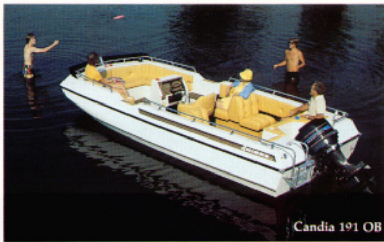
Candia 191 OB