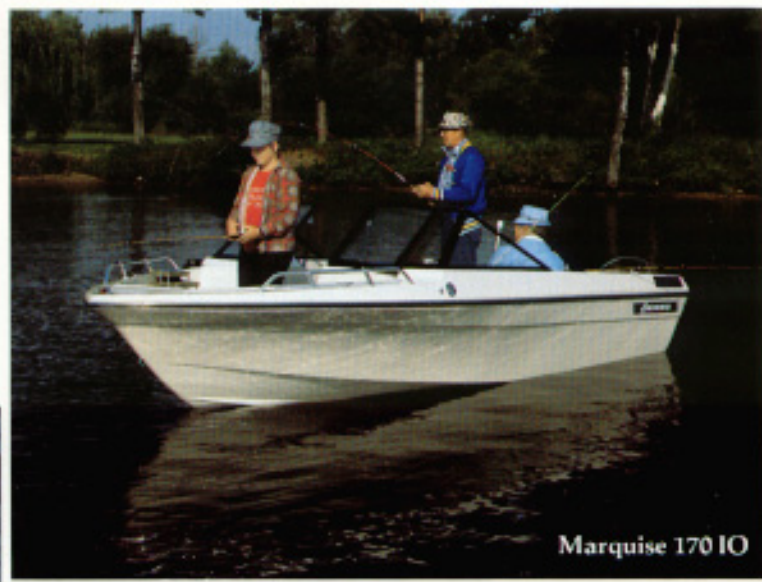
Marquise 170 IO

The little brother of the Marquise family, this is a "V" for the young at heart. Lots of zip and loads of room packed into a 14½-ft. hull. Over 6½-ft. wide, it weighs only 600 lbs. That makes it great for skiing, swimming or cruising. And saving fuel . The light, strong, 4 Winns hull lets it exceed 40 mph. It'll hold up to a 70 hp outboard . . . and lots of skiers and equipment. Fun from the word "go!"