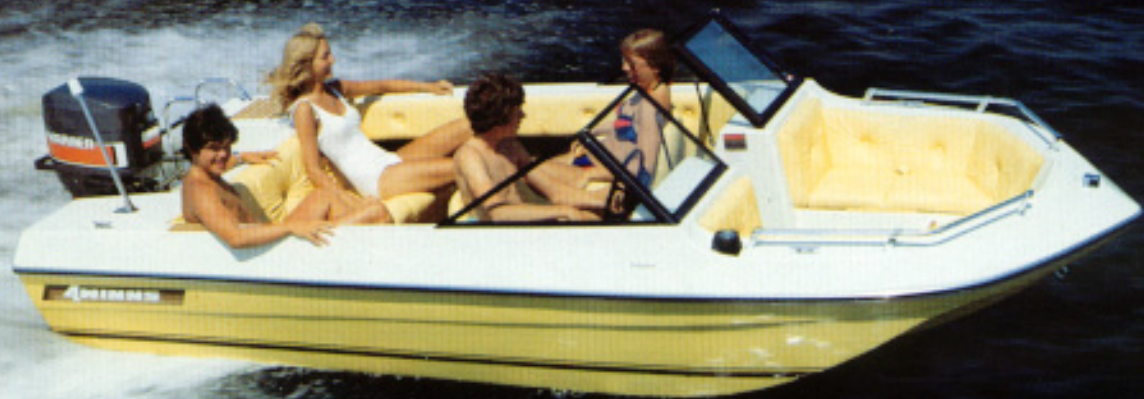
Catalina 150 Brougham