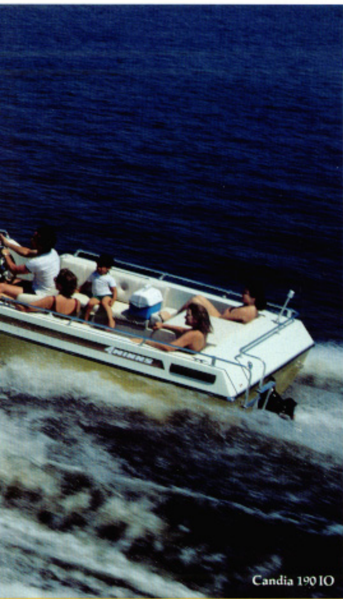
Candia 190 IO