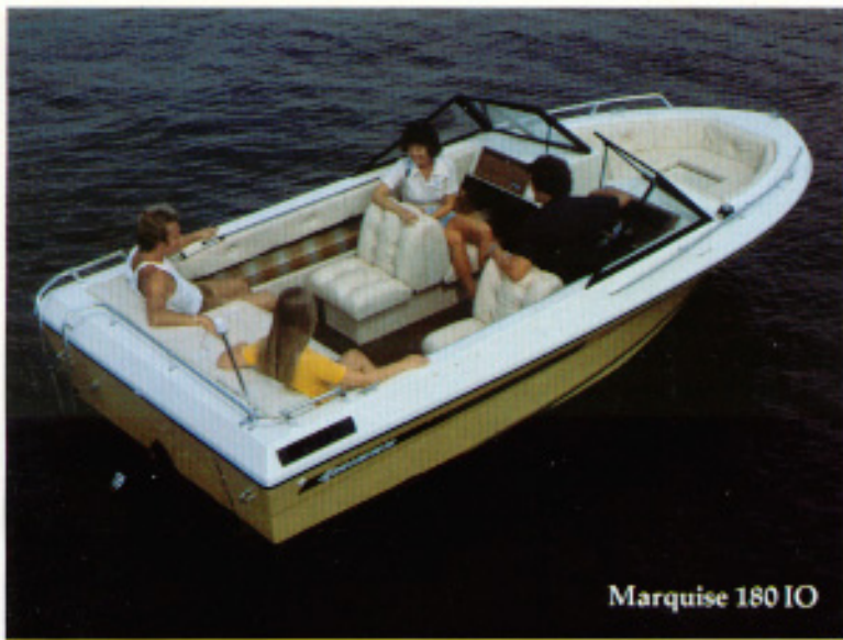
Marquise 180 IO

Now better than ever, with more options, floor plans and fun features. The cuddy-cabin V-berth sleeps two in comfort, with room for a porta-potti. The IO and cuddy have a hidden canvas top storage. The open bow models have 26-inch deep seats so you stay dry. The Brougham has full-width plush rear bench, plus two forward bucket seats. And the outboard model is lively. The 18-foot deep "V" hull has a 91-inch beam, with 48-inch depth. And it's light and fast: 40 mph with four adults pushed by a 140 hp motor. Both IO and OB have a 27-gal. under-floor fuel tank.