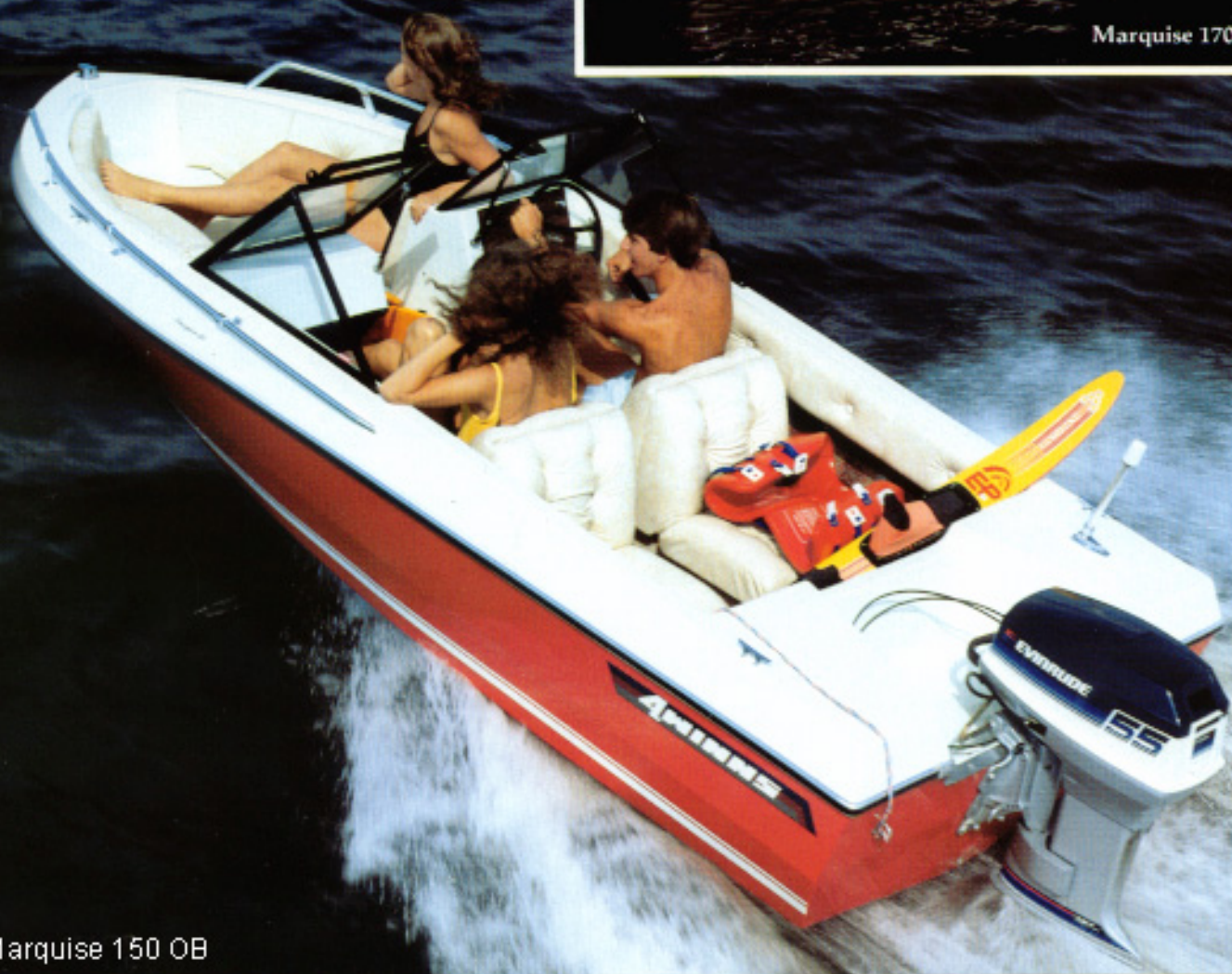
Marquise 150 OB