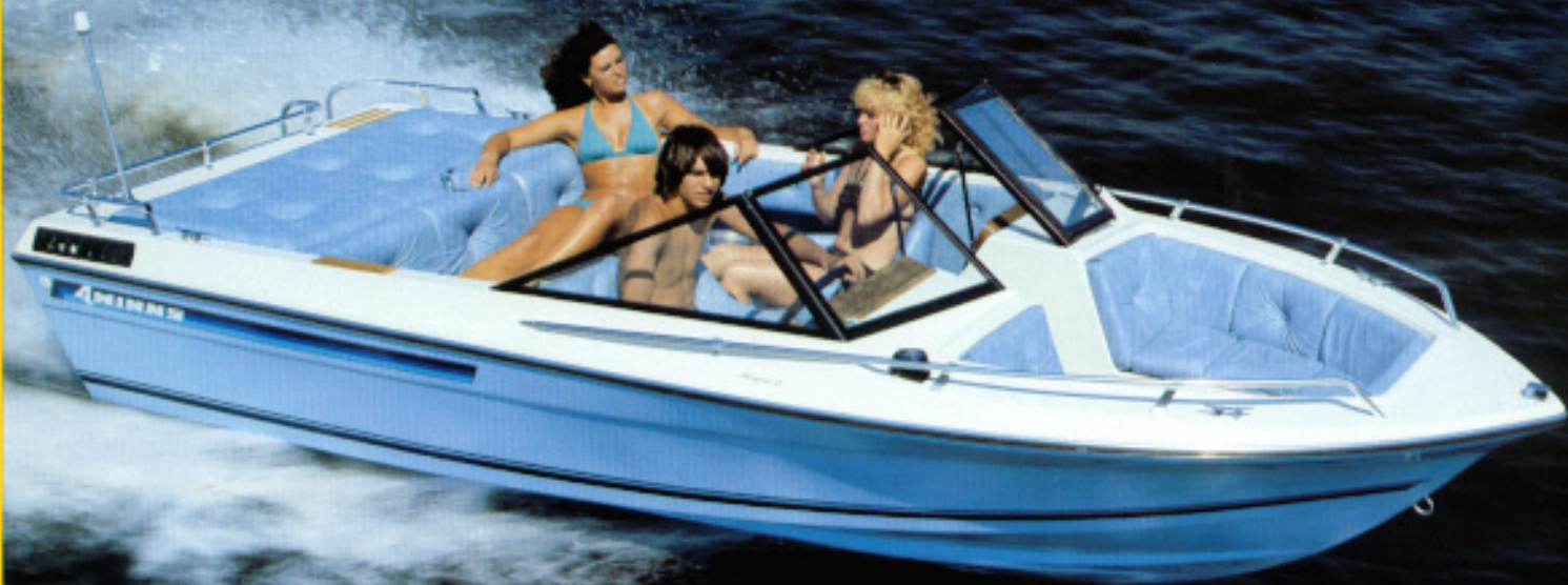
Marquise 170 Brougham