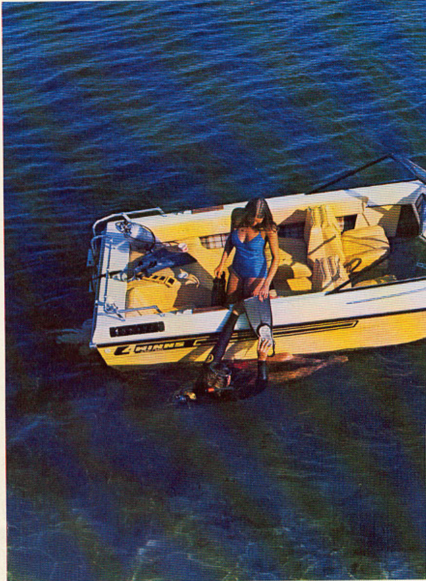
MARQUISE 170 I/O OPEN DECK