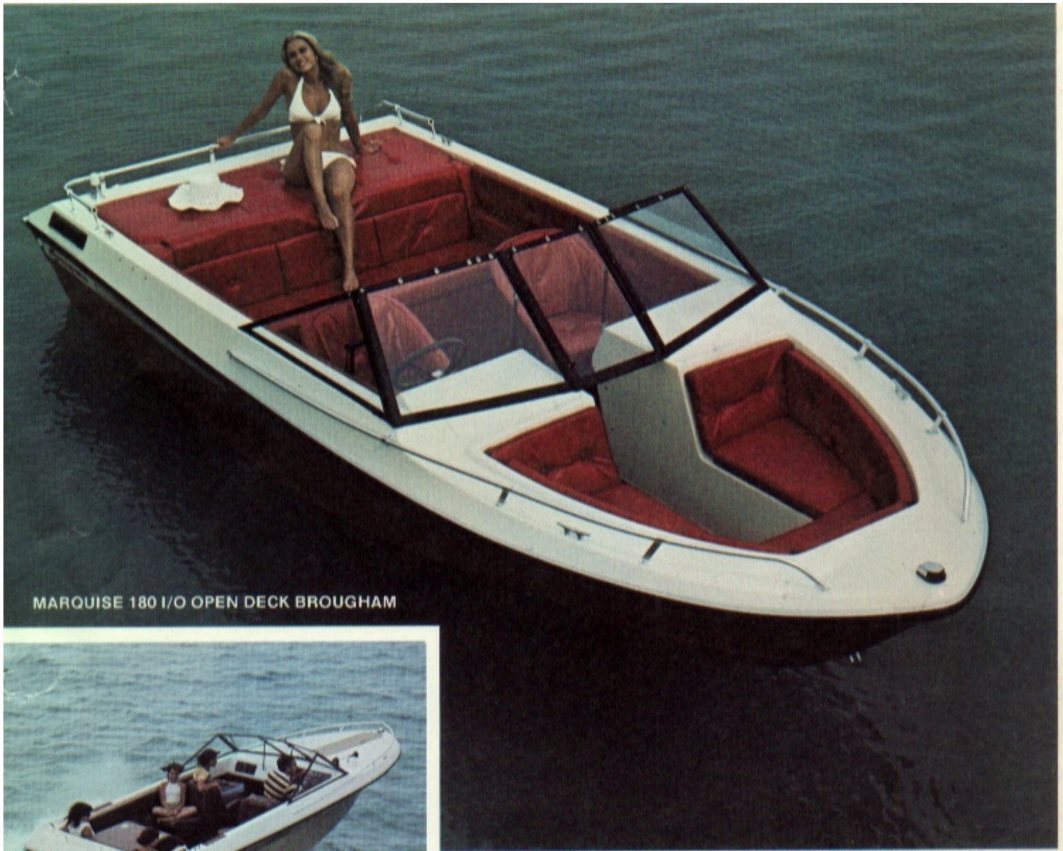
MARQUISE 180 I/O OPEN DECK BROUGHAM