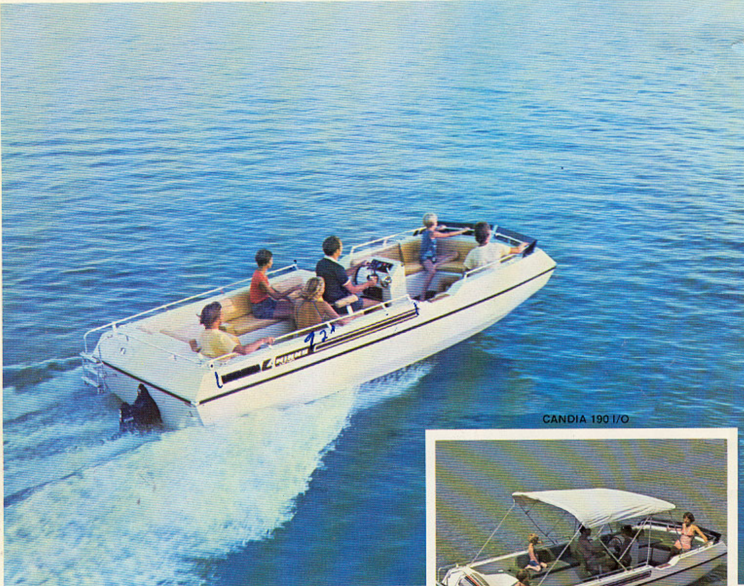
CANDIA 190 I/O