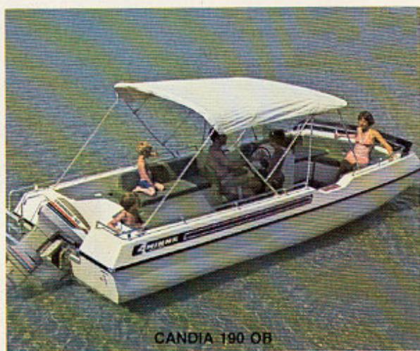
CANDIA 190 OB

Standard equipment includes front, side and rear storage, complete hardware and lighting, horn, ice chest, built-in 18+ gal. gas tank, 3-step boarding ladder and venturi windshield. Optional party tables and canvas coverings also are available.