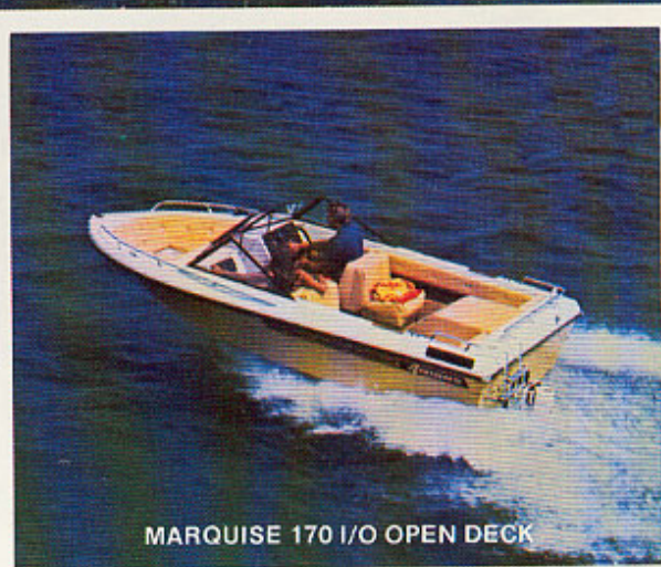
MARQUISE 170 I/O OPEN DECK

Standard equipment includes complete hardware and lighting, two-way folding deluxe seats, locking glove box, horn, ice chest, 3-step folding swim-ladder, bow & stern rails, 20-gal. below-floor gas tank, plush PCP Celanese carpeting (and teak strips on the closed deck model).