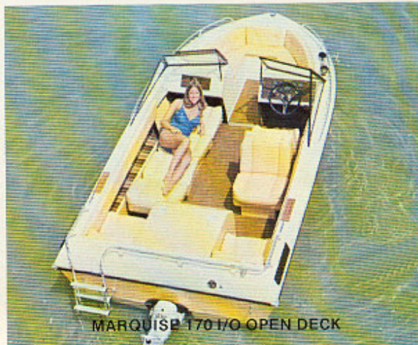
MARQUISE 170 I/O OPEN DECK