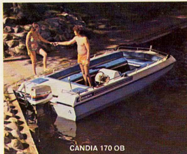
CANDIA 170 OB

A 17-foot deck boat that accommodates seating for over 10 passengers. How's that for spaciousness? An 87" beam makes it stable, the thick foam cushions make it comfortable. This smaller sister to the Candia 190 retains all the features of that design, including its ability to speed with less horsepower and start out on plane. As above, the Candia 170 is available in both I/O and outboard models.