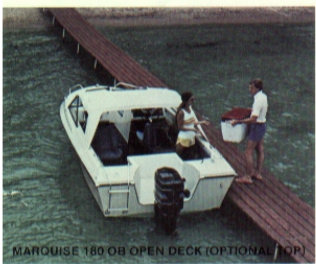
MARQUISE 180 OB OPEN DECK (OPTIONAL TOP)