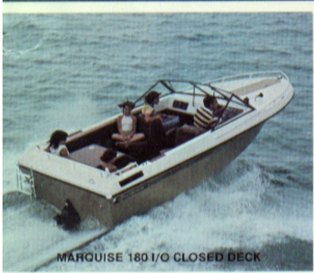
MARQUISE 180 I/O CLOSED DECK