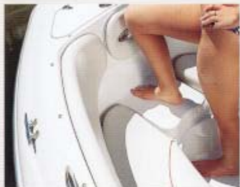
Integrated bow step for convenient and easy boarding.