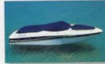
Cockpit and Forward Cover