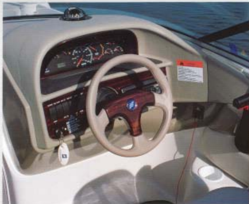
Ergonomically designed helm complete with integrated VDO module including built-in depth finder and clock.