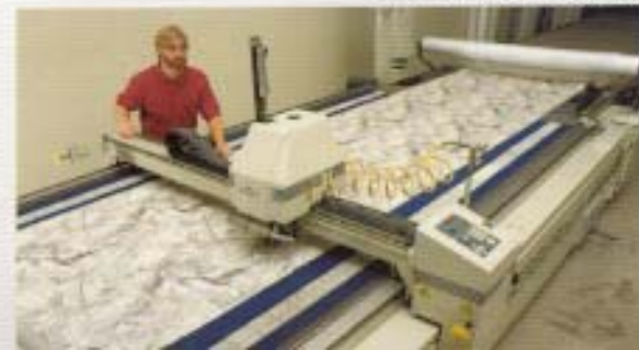
CNC 3-axis fabric cutter

We invest in this level of technical support to meet the most stringent standards imaginable...yours.