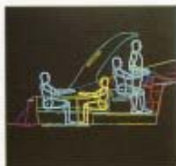
Our boats are ergonomically designed

When you step aboard a Four Winns you'll notice an immediate difference. The wider beams and helm-forward design is evident in every boat we build from the 170 Horizon to the 328 Vista. The result is more useable space and added comfort. A Four Winns helm is renowned for its convenience. It's designed to accommodate large drivers or small with equal ease. Controls are positioned right where they should be.