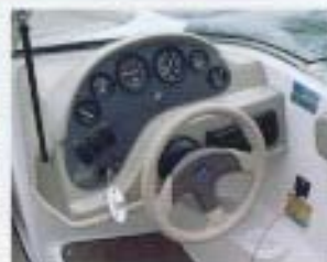
A helm that makes sense. Easy-to-read gauges at a single glance.