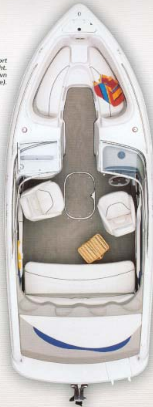
Optional SunSport seating shown at right. (Standard seating shown on opposite page).