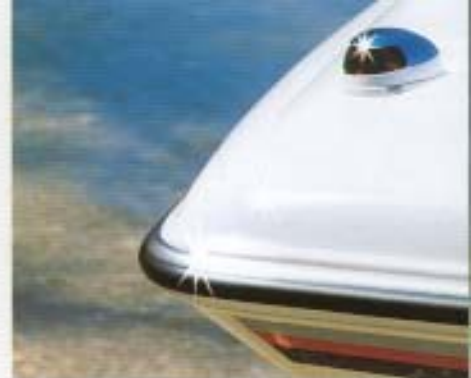
100% Armorcote® gel finish

Details like these might be missed by a casual shopper, but they're just some of the many reasons Four Winns boats