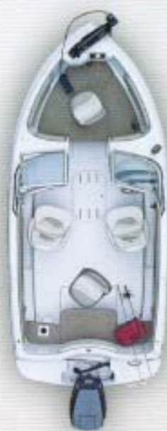
Outboard model available with Standard or SunSport seating. Optional Fish & Ski package shown at right. (SunSport seating shown above).