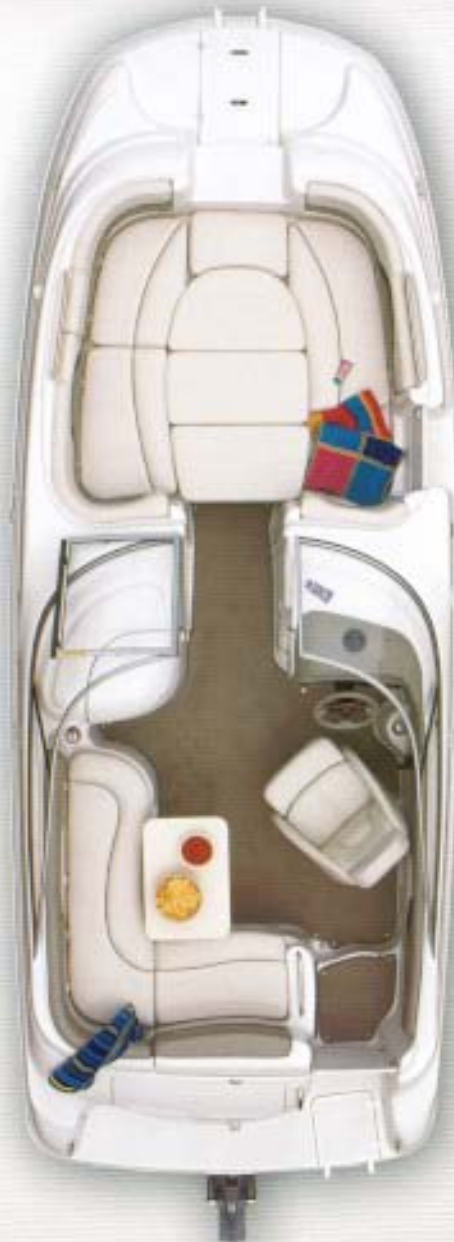
Candia provides room for everyone and storage for everything including built-in cooler storage, skis and knee-boards.