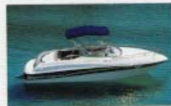
Southwest Bimini Top