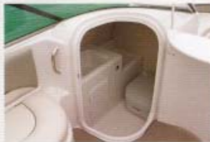
A roomy head offers shelf storage, lighting, opening port light, removable carpet and sink.