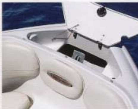
Hidden locker keeps anchor out of sight.