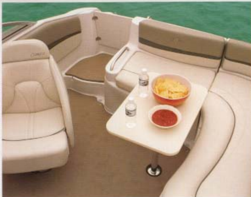
Aft cockpit table and swivel lounger make Candia a gracious socializing platform.