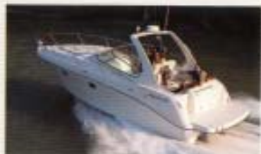
Ask your dealer about our line of Vista cruisers.