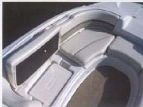
Additional removable cooler under port bow seat.