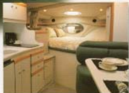
328 Vista cabin