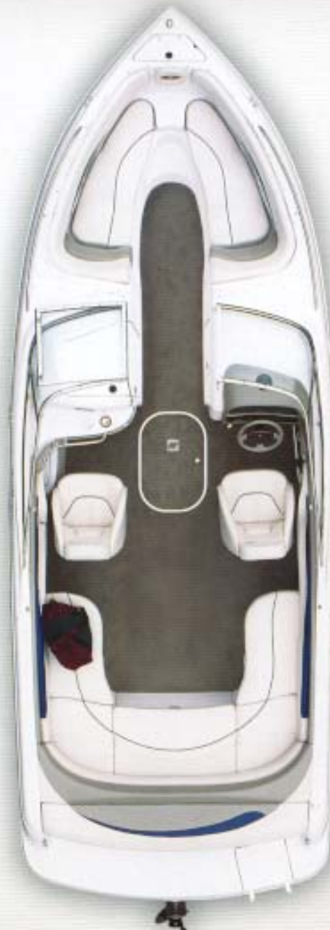
Optional U-wrap seating shown at right. (Optional SunSport shown on opposite page. Standard seating features back-to-back seating).