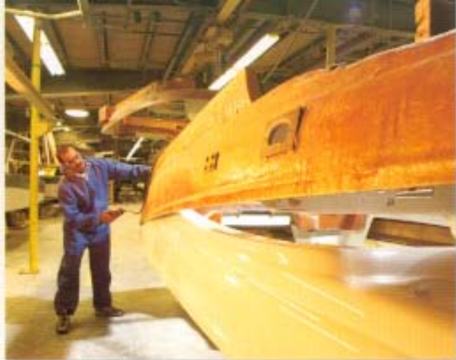
Deck overlay template that assures accurate part placement

All of our fiberglass parts feature Armorcote® gel coat. 100% of our parts. Few other boat builders do that. It costs more, but it's worth it. You receive a boat that's