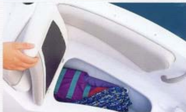
Large capacity storage areas are found under the hinged bow seats.