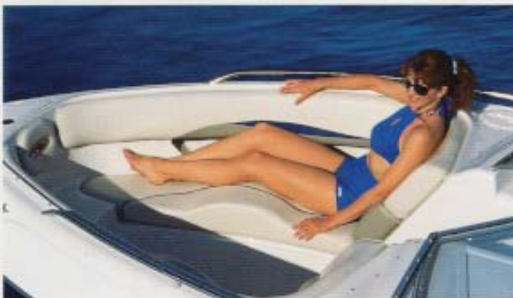
A built-in canted lounge in the bow provides a natural place to relax.