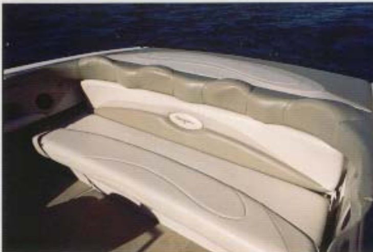
Wide Beam design means more room to relax and work on your tan.