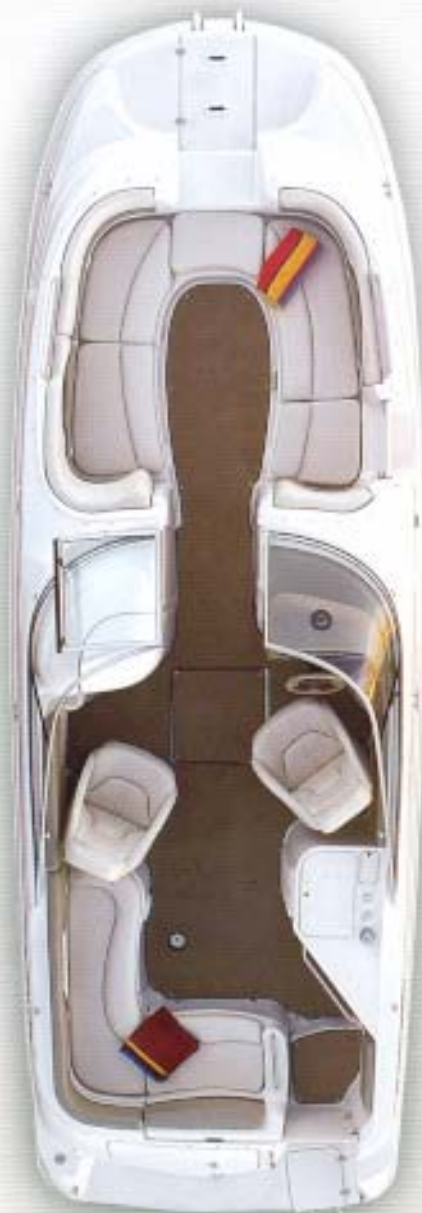
Candia provides a complete entertainment package for skiing, swimming, socializing and just fun.