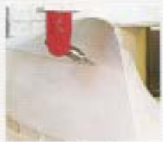
5-axis mill router

Four Winns holds many patents and has established breakthroughs in virtually every area of boat design and construction. Our revolutionary Stable-Vee® hull design is one example. Each running surface is designed for maximum efficiency and stability with sophisticated computer simulation technology. The new hull design becomes reality with an advanced 5-axis router that's incredibly accurate and fast.