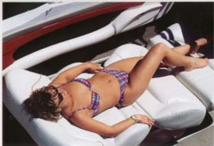
New double-wide port lounge gives you extra room and more comfort.