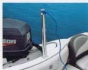
Optional pylon keeps ski line at an ideal angle for better performance and easier skiing.