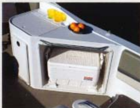
Cockpit entertainment center includes removable cooler, trash receptacle and covered sink with additional storage.