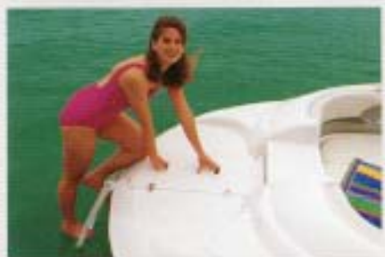
Bow platform and deep-reach swim ladder allow for easy boarding after a cool dip.