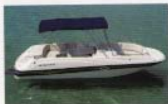
Bimini top on Candia FS

All factory-installed color-matched canvas configurations are custom sewn and hand fitted on every individual boat to provide a tailored look. Available configurations vary from model to model. Talk to your Four Winns Professional Retailer for details.