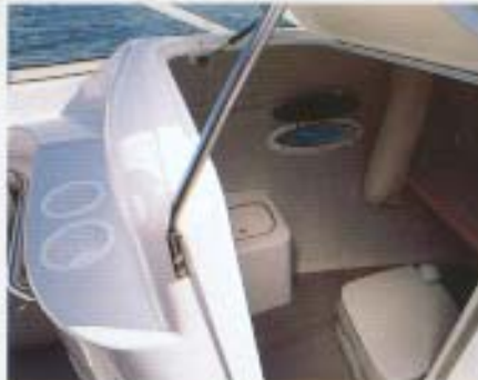
A roomy, enclosed head is a convenient feature on a boat of this size.