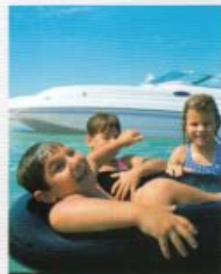
Making boating fun

hundreds of the people who build the product day in and day out. It works, and works well. Week after week, Four Winns employees create new ways of making our boats just that much better.