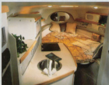
Innovations like backrest cushions that double as Vee-berth fill-ins are a Four Winns exclusive.