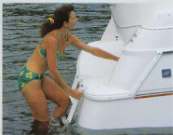
Our deep-reach, angled ladder is one of the easiest to use.

For style, value, and cruising pleasure, you can't find a more versatile cruising selection than the 238 Vista from Four Winns. Here is a full cruiser in a size that will be effortless to handle and with all the appointments that makes Four Winns boating easy.