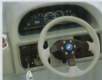
The automotive-style instrument panel makes everyone feel at home at the helm.